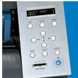
Large, ergonomically angled, backlit LCD control panel is easy to see while loading media.

(3) According to Roland measurement criteria: • Using the included software from Roland. • Using a laser or ink-jet printer having a resolution of 720dpi or better. • Excluding glossy or laminated material. • Excluding effects of printing distortion due to printer precision and effects of material expansion, contraction, or warping. Depending on the ink (black) employed by the printer used, correct sensing may not be possible.