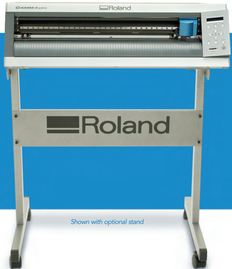
Shown with optional stand

Cut intricate vehicle graphics with precision and speed.