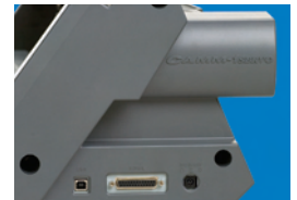
Digital servomotor technology ensures the cutter's maximum accuracy and cutting speeds up to 20-inches per second. Easy access USB and serial ports make connectivity a snap.

Roland reserves the right to make changes in specifications, materials or accessories without notice. Your actual output may vary. For optimum output quality, periodic maintenance to critical components may be required. Please contact your Roland dealer for details. No guarantee or warranty is implied other than expressly stated. Roland shall not be liable for any incidental or consequential damages, whether foreseeable or not, caused by defects in such products. All trademarks are the property of their respective owners.